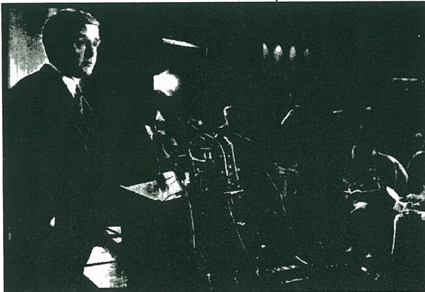
Henry Holt & Co.